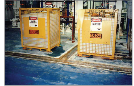
Super Vi-Corr® Resin for Highly Corrosive Environments